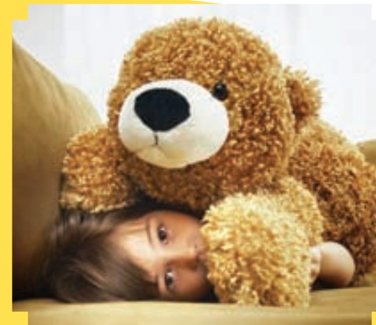
The CE label on toys means that they comply with European safety rules.

Recently released figures show a rapid rise in the number of dangerous goods withdrawn from sale across the European Union thanks to the EU-wide alert system to protect consumers. New member states which joined the EU in 2004 are now also notifying Rapex about products on sale on their markets. Toys now form the biggest category of hazardous goods on sale.