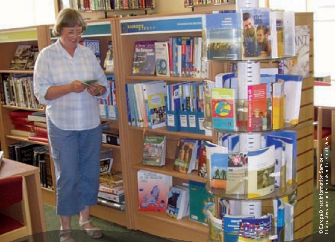
© Europe Direct Information Service – Gloucestershire and Schools of the South West